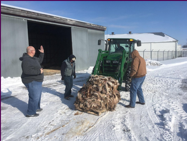
Members prepare Deer Hides for transport to tannery for our Vets!